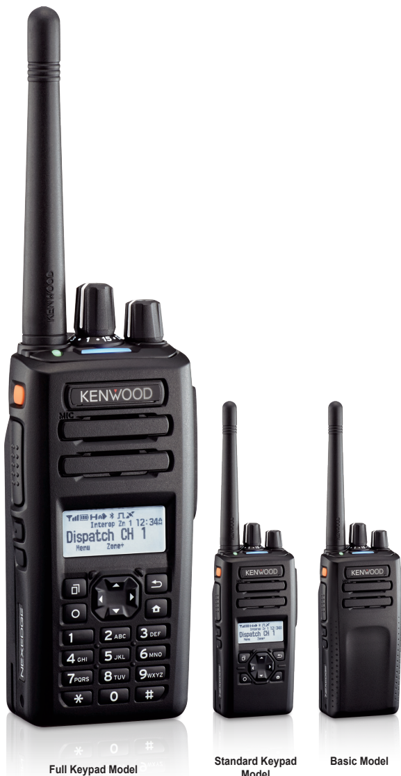
Full Keypad Model